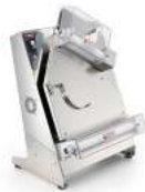
P-Roll 320/2 - P-Roll 420/2