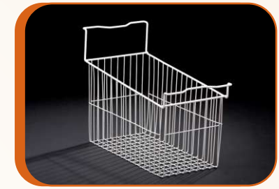
WIDE ASSORTMENT OF BASKETS