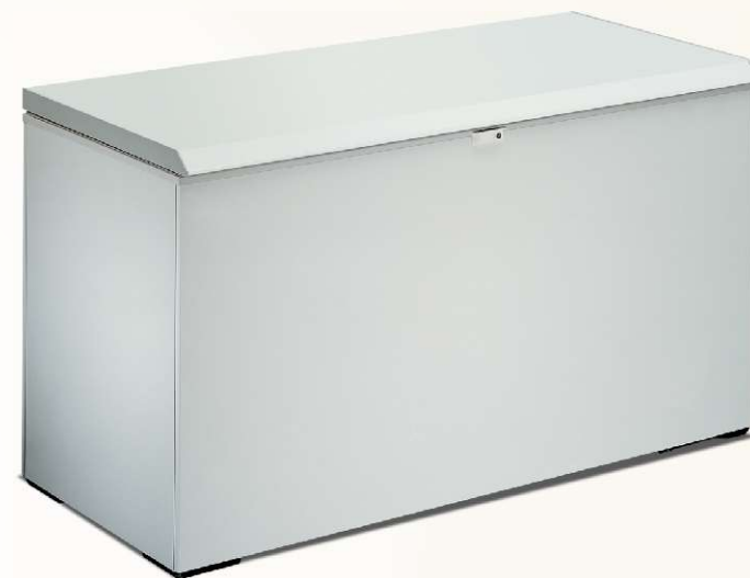
F 58 Chest Freezer