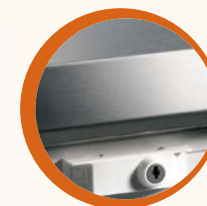
STAINLESS STEEL LID AVAILABLE*