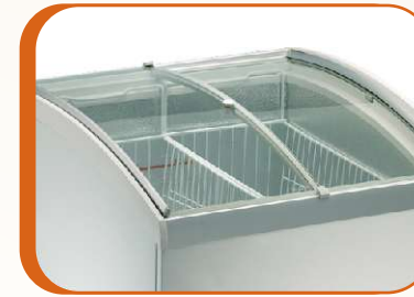
CURVED SLIDING GLASS LIDS