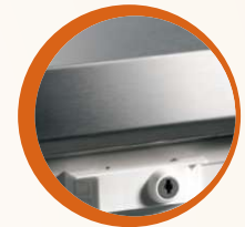
STAINLESS STEEL LID AVAILABLE*