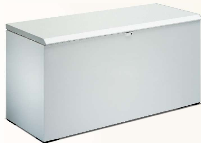
F 68 Chest Freezer